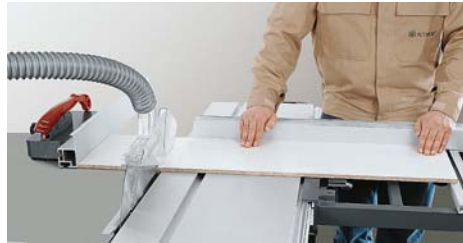
Cut panel strips to final length on the rip fence.