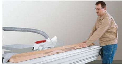
Align and trim the material along the cutting line.