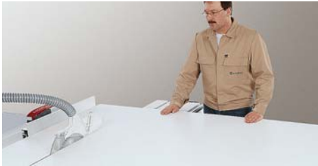
Cut panel strips on the rip fence.