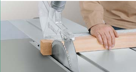
Make a square cut.