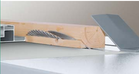
Fix the workpiece under the clamping shoe and cut the chamfer.