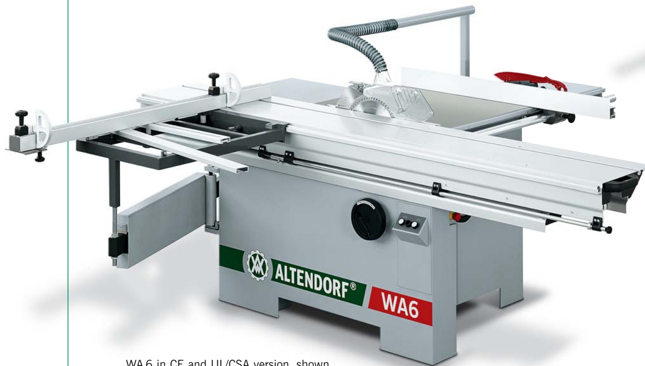
WA 6 in CE and UL/CSA version, shown with 2600 mm (102.36 inch) double roller carriage, 8.2 ft. cutting length