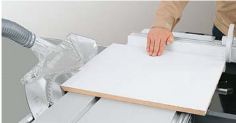
Tilt the saw blade to the desired angle, lay the workpiece against the crosscut fence.