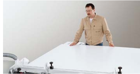
Cut to square.