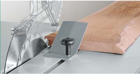
The clamping shoe secures the board on the double roller carriage.