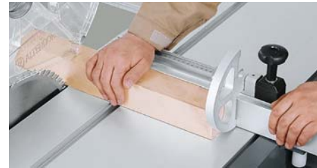
Cut the remaining piece to size on the crosscut fence.