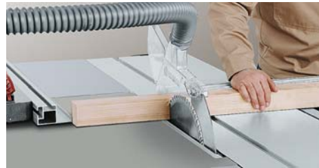
Position the rip fence in front of the saw blade, set to the required length and cut.