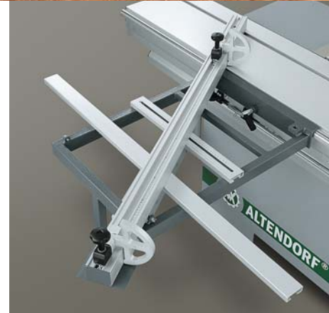
Crosscut-mitre fence: for accurate angle and mitre cutting in a single function. Cutting lengths: 95–2600 mm (37.4–102.36 inch) Mitre angle infinitely adjustable from 0–49°.