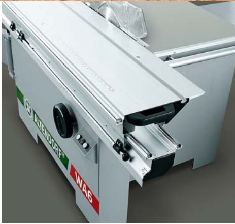
The proven Altendorf double roller carriage with steel bar guidance.