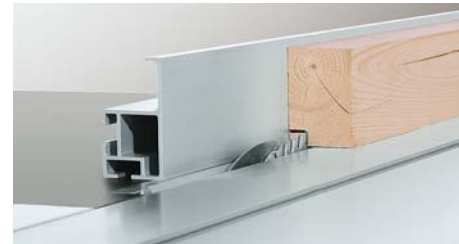
Set the height of the riving knife to 2 mm below the top of the saw blade teeth and position the rip fence behind the saw blade.