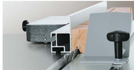
Set the height of the blade and the width on the rip fence.