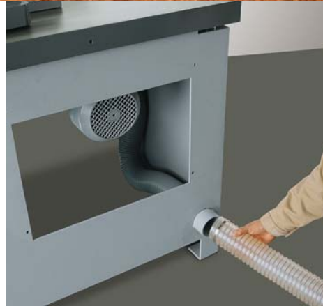
Extraction supports on the machine pillars (extraction socket: Ø 90 mm/3.54 inch).