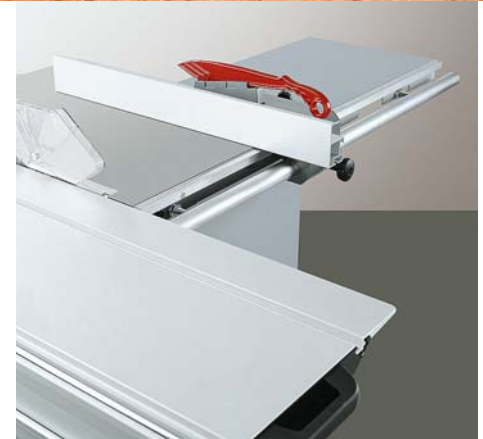
The rip fence, smooth and precise.