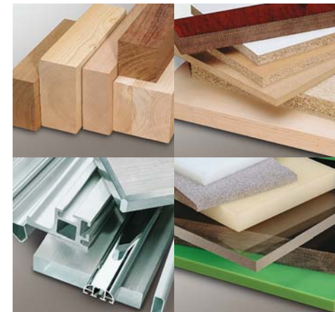
The WA 6 cleanly cuts wood, plastics and non-ferrous metals.

The Altendorf WA 6 is a quality sliding table saw for professional demands. Since the establishment of the company and the invention of the sliding table saw by Wilhelm Altendorf in 1906, Altendorf has been a synonym throughout the world for this type of machine. Altendorf has for decades been the unchallenged world market leader, and has now sold well over 120 000 sliding table saws in more than 120 countries around the globe. Altendorf manufactures at two production sites, in Minden, Germany, and in Qinhuangdao, China, using the latest technology and the highest standards.