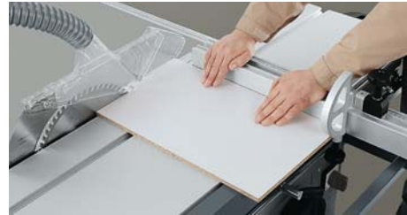
Cut the remaining piece to size on the crosscut fence.