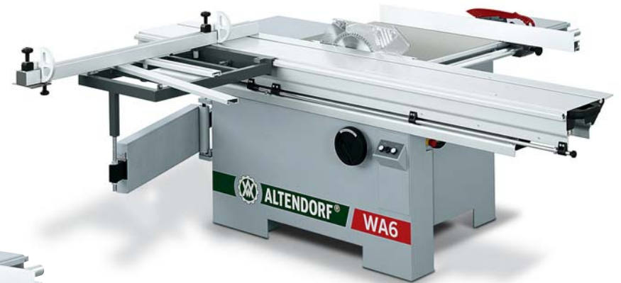
WA 6 in non-CE version, shown with 2600 mm (102.36 inch) double roller carriage (not available in North America)