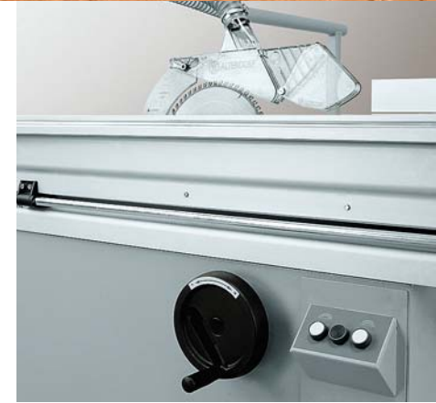
Manual rise/fall adjustment.