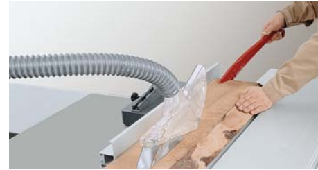
Guide the workpiece along the rip fence and over the rotating saw blade, using the push stick if necessary.