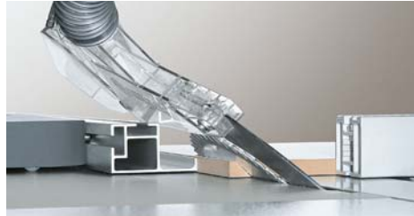
Bevel ripping on the rip fence with workpiece on the sliding table.