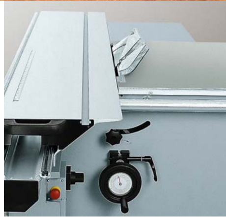
Manual tilt adjustment.