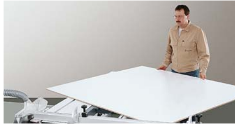
Turn the panel anti-clockwise and place the trimmed edge against the fence.