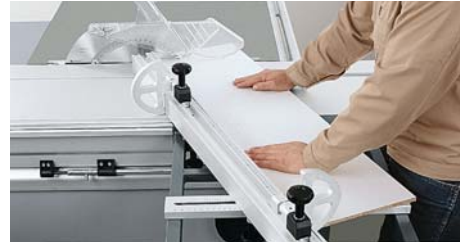
Mitre cut using crosscut-mitre fence.