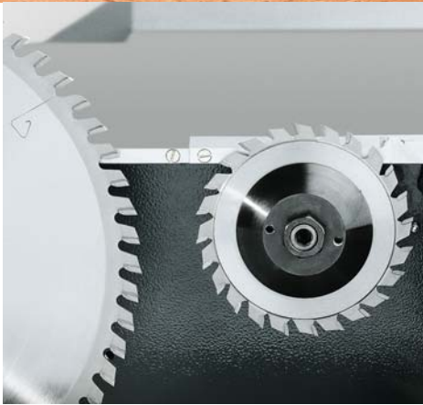
The scorer. Separate 0.37 kW (0.5 HP) scoring motor with on/off switch.