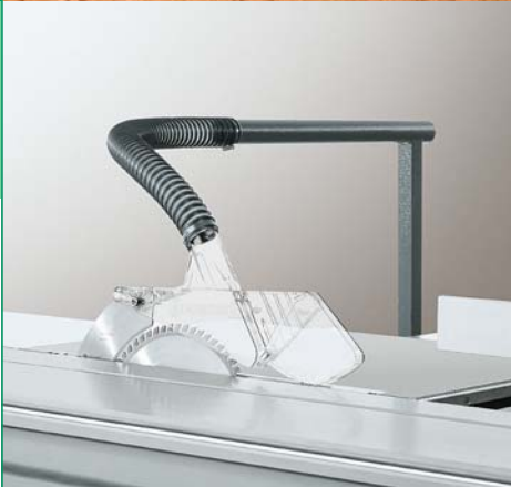
Safety hood with extraction hose above the main saw blade.