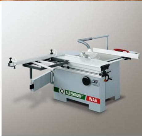
Short sliding table: if requested the machine can also be supplied with 1 600 mm (63 inch) table.