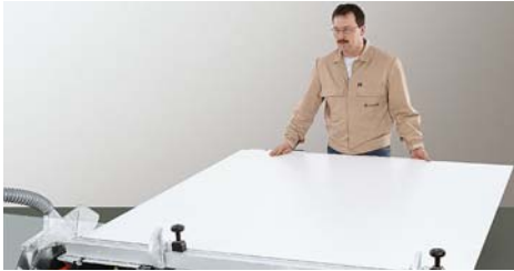
Align the panel and make a trim cut.