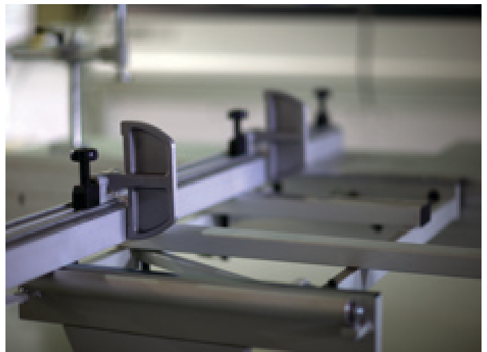
Telescoping Cross Cut Extension Fence