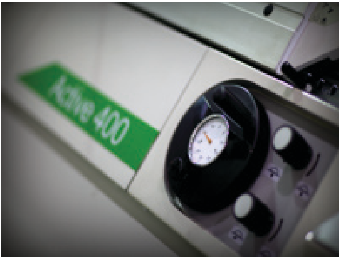
Tilting Movement of Main Saw Blade with Hand Wheel Indicator