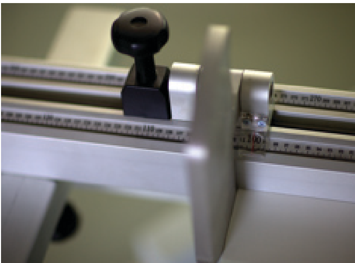
Precision Flip Stops with "Easy Read" lens