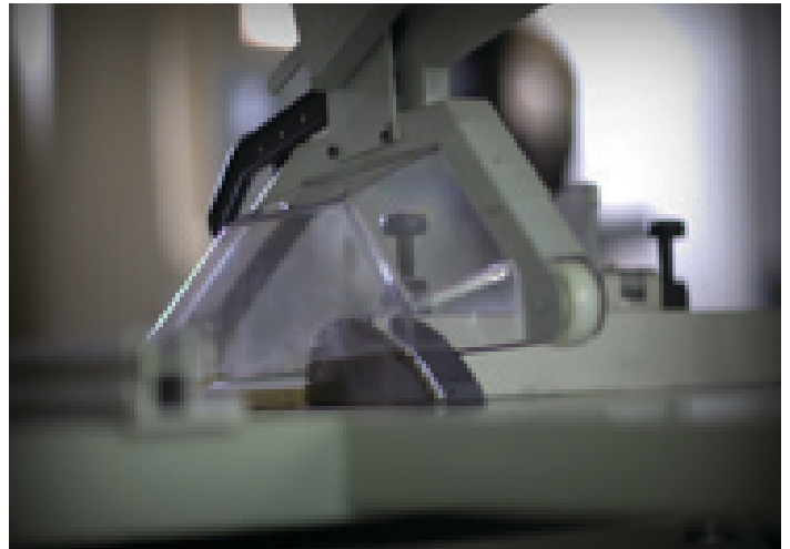
Blade Cover with Safety Guard and Dust Extraction Port.