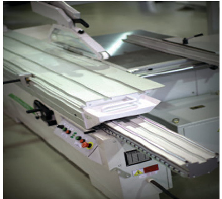
Telescoping Cross Cut Extension Fence