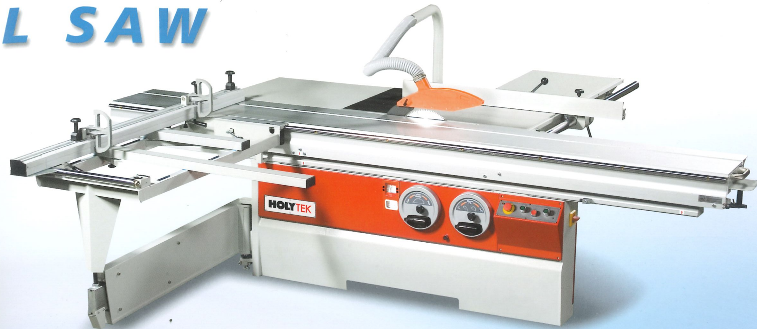
▲ Sliding Panel Saw With Mechanical Type Angle & Speed Rotation RPM Setting

Heavy-Duty Aluminum Sliding Frame Design with Reasonable Price!