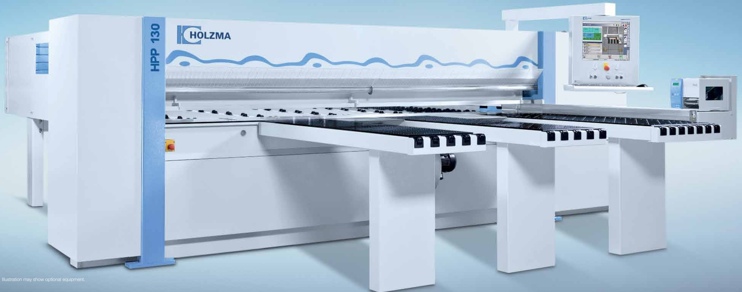
Illustration may show optional equipment.