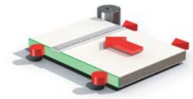
2° Cycle Parallelism and perfect measure

Panel is loaded on the squaring carriage, the mobile pushers of the left fence keep panel pressed against the right fence