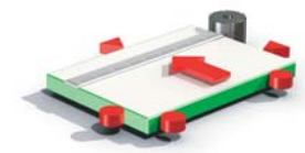
4° Cycle Squaring of the fourth side

Panel is blocked against the rear reference stops and leaned against the right fence is fed into the machine up to the milling unit to make the squaring of the third side.