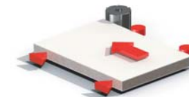
1° Cycle Milling of the 1° side

Panel is loaded on the squaring carriage, the mobile pushers of the left fence keep panel pressed against the right fence