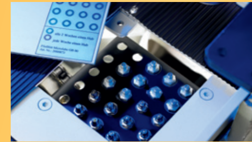
Centralised lubrication type point to point