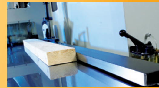
Hard-chromium plated machine tables