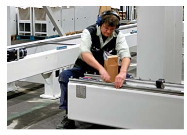
MOReTENs has been producing woodworking machinery for over 25 years. The innovative design shaped by the needs of our customers has allowed us to produce cost effective solutions and unique benefits.