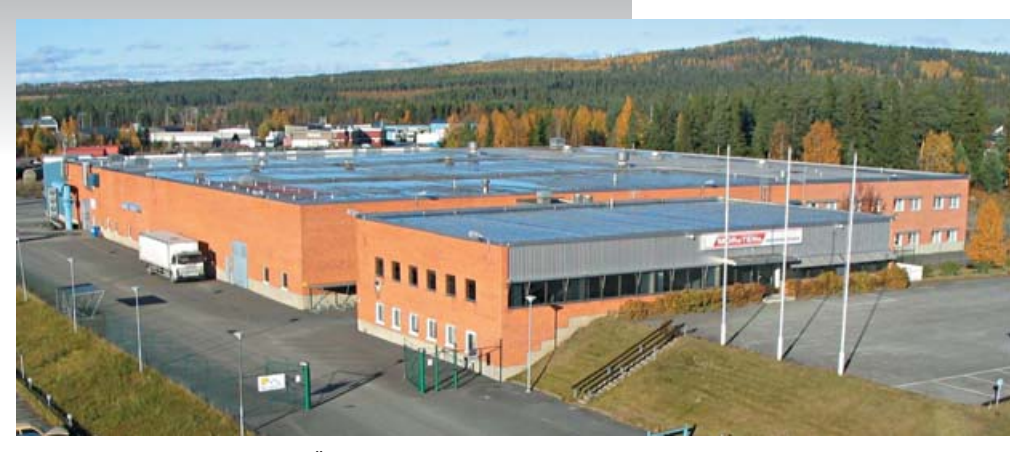
MORETENs manufacturing unit in Östersund, Sweden. Here all our machines are manufactured to the highest standards of quality