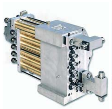
Drill boxes & Spindles