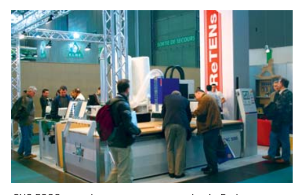
CNC 5000 at major european convention in Paris