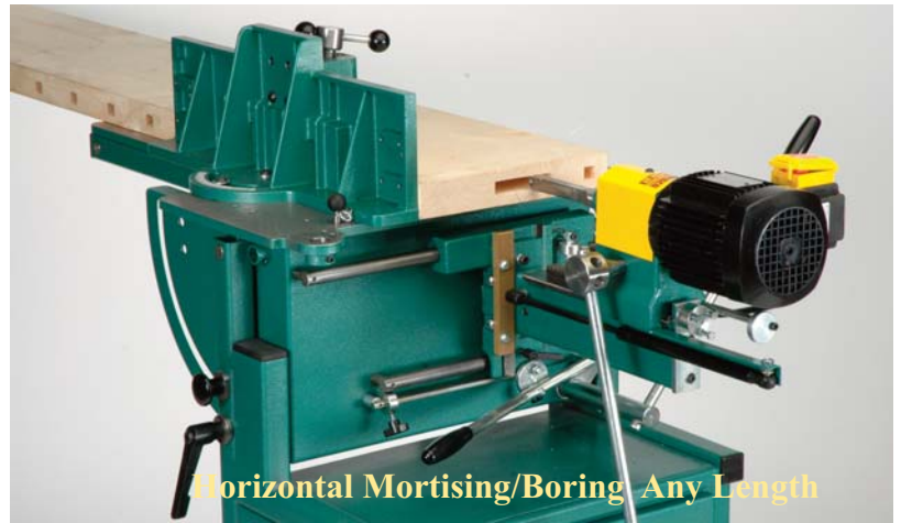
Horizontal Mortising/Boring Any Length