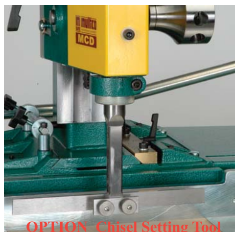
OPTION Chisel Setting Tool