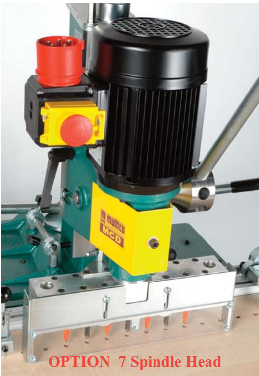
OPTION 7 Spindle Head