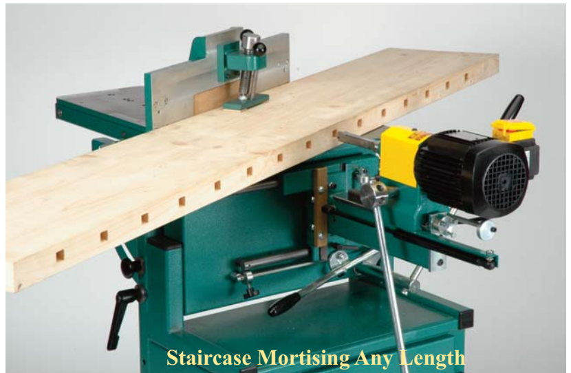
Staircase Mortising Any Length