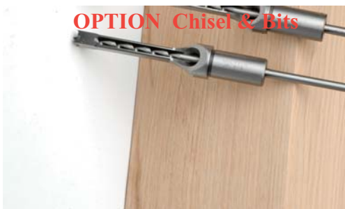
OPTION Chisel & Bits