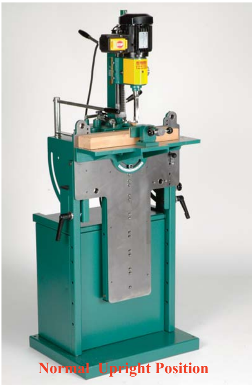
Normal Upright Position