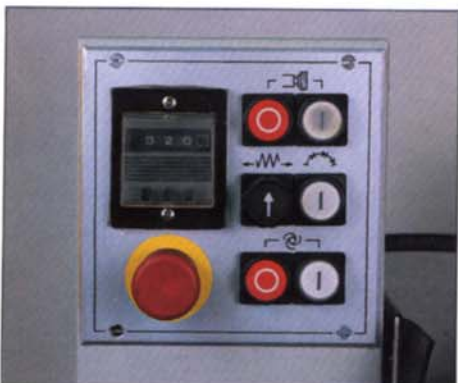
Clearly visible at the switch panel: this grinder is easy to handle.