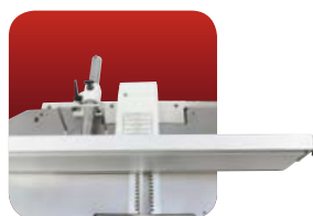
Planing Fence absolute rigidity

Professional planers at an affordable price, for joineries and demanding craftsmen that do not settle for less.