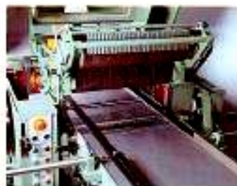
First sectional feed roll and anti-kickback finger set raised to give plenty of access to the bottom head for setting knives and joining.

In conclusion, it should be stated here that Pinheiro has substantially proven it's commitment to efficiently serve the American woodworker and to lead the way in developing new machines and systems to offer both the primary and secondary wood industries the maximum amount of Efficient Flexibility at a very affordable cost, backed by quality service, parts and training programs.