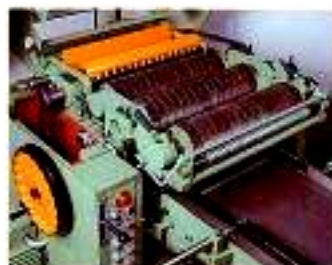
Front set of anti-kickback fingers, top three sectional infeed rolls, sectional chip-breaker, pressure bar and dust shields.