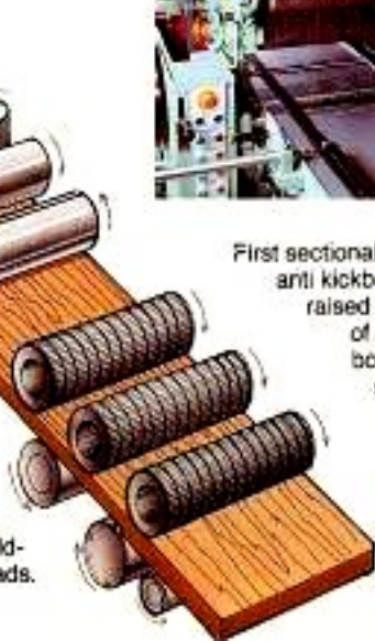
Illustration of feed rolls, outfeed hold-downs and cutter heads.