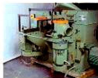
MF4 8" sidehead section that can be installed on MF2 at anytime to quickly convert the double surfacer into a 4 or 5 head planer/matcher/molder.